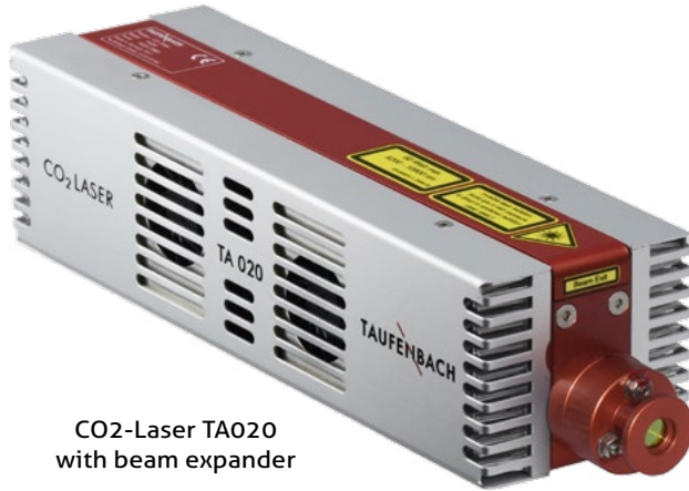
CO 2 -Laser TA020 with beam expander