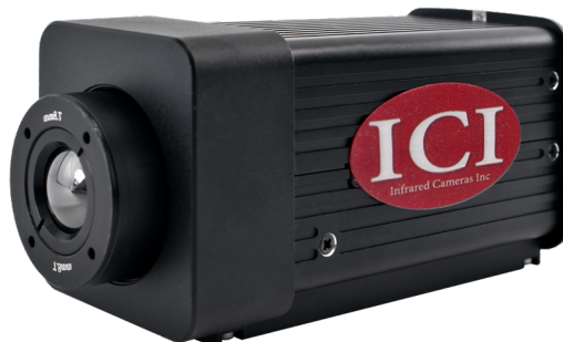
FMX 400 P-Series

Remote fixed mounted thermal management systems are designed to provide detection capabilities of hard-to-reach areas or places where safety is a concern. FMX 400 devices have been utilized to monitor critical equipment, flares, flare pilots, electrical connections, and tank levels in real-time. Perfect for finding and locating critical failures as well as abnormal temperatures in pipelines and storage facilities. Powered by ICI's proprietary SmartIR software, which includes analytics, work order integration, alerts and notifications, and live video feeds for remote monitoring.