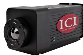
FMX 400 P-Series